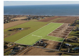
231 Hedges Lane SAGAPONACK GREENS. Stretching southwards towards the pristine beaches of... More details

It's not about predicting a market change. It's about preparing for it.