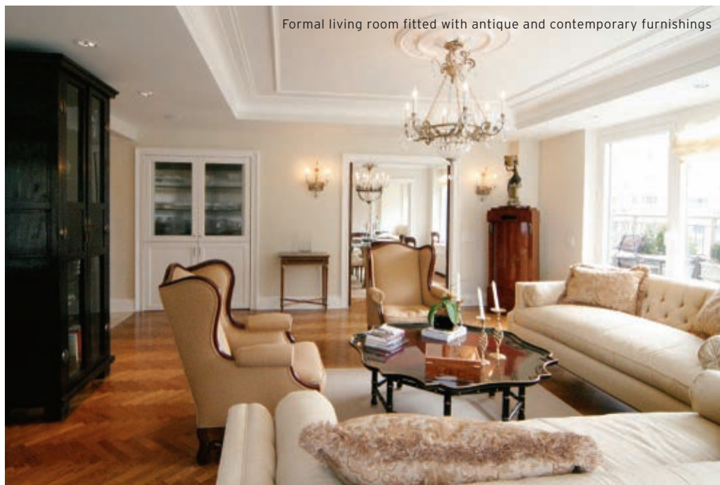
Formal living room fitted with antique and contemporary furnishings

aesthetics and form become function and lifestyle