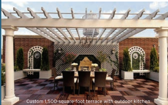
Custom 1,500-square-foot terrace with outdoor kitchen