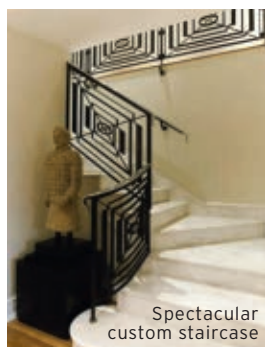
Spectacular custom staircase