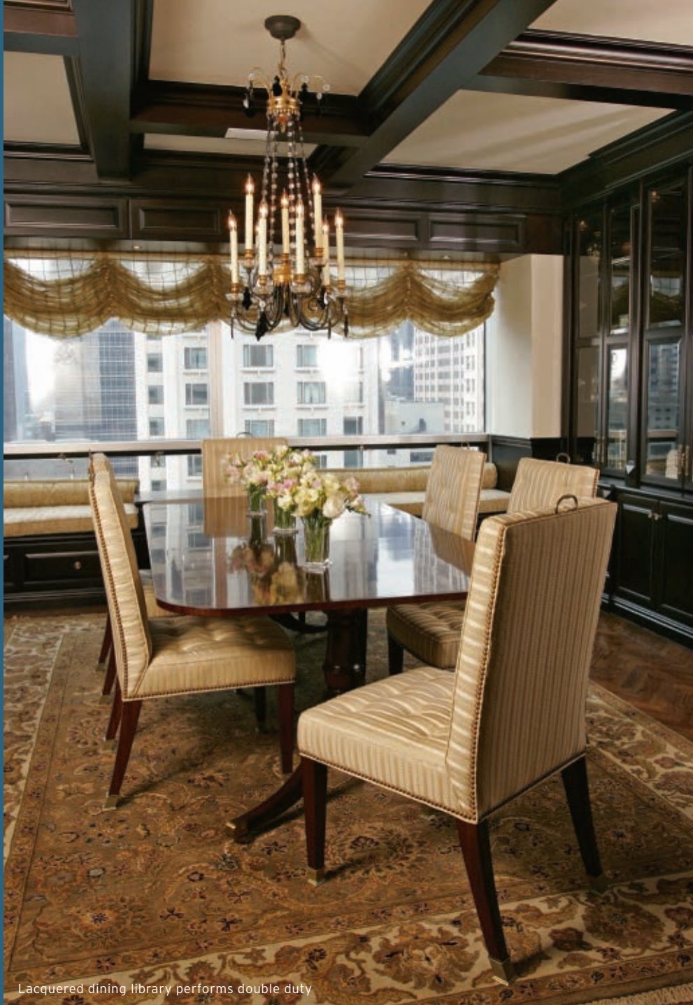
Lacquered dining library performs double duty